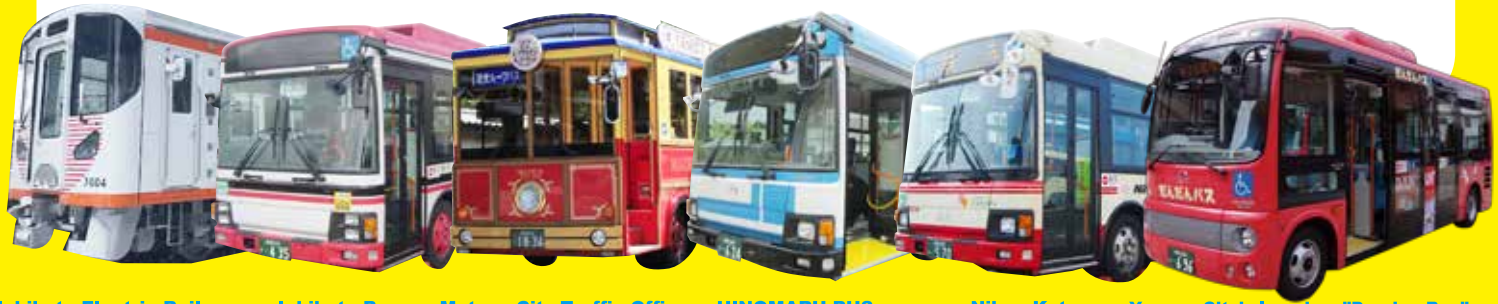
Ichibata Electric Railway Ichibata Bus Matsue City Traffic Office HINOMARU BUS Nihon Kotsu Yonago City's loop bus "Dandan Bus"

Notes ※Routes where TRANSPORT PASS is not applicable 【Train】 Not applicable to JR routes 【Bus】①Izumo Enmusubi Airport ⇄ Matsue Station②Izumo Enmusubi Airport ⇄ Matsue Shinjiko Onsen Station ③Izumo Enmusubi Airport ⇄ Izumo-shi Station④Izumo Enmusubi Airport ⇄ Izumo Taisha Grand Shrine ⑤Izumo Enmusubi Airport ⇄ Tamatsukuri Onsen⑥Yonago Kitaro Airport ⇄ Matsue Station ⑦Matsue ⇄ Shichirui Port (Connects with Oki Kisen's ferry)⑧Matsue⇄ Sakaiminato⑨Community bus as a whole⑩Extra bus ※If you take a route to which the pass doesn't apply or during the inapplicable hours, you'll be required to pay for the relevant fees ※The pass is not refundable